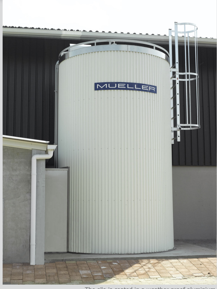
The silo is coated in a weather proof aluminium jacket in a 'off-white' colour.