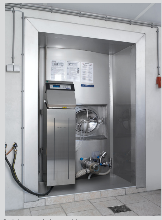
Stainless steel alcove with built-in MIII cooling & cleaning control system